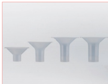
Funnel Size 21 / 24 / 27 / 32 mm