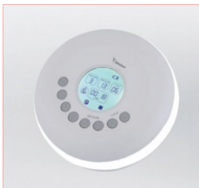
Nursing Night Lamp